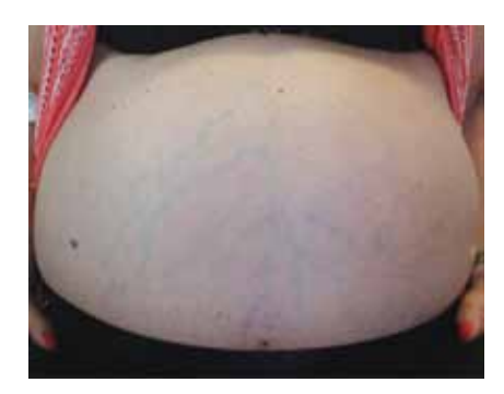
FIGURE 1. Image of the patient showing a large abdominal enlargement.